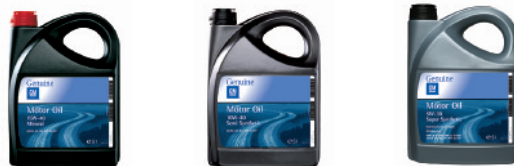
There are three main types of engine oil: Mineral Oil, Semi-Synthetic Oil and Super Synthetic Oil

The recommended type of oil for your car can be found in your Vauxhall Owner's Manual/Service Booklet. Vauxhall approved oils offer complete protection from the moment the engine is started. They are designed to give smooth performance, low emissions and improved fuel economy – all geared to maximising your engine's life. Use of inferior specification oil may have a detrimental effect on engine life and performance.